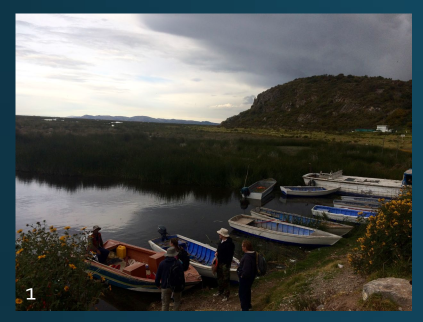
Photo 1 Nelson picking up team members at the shore of Lake Titicaca to take to the Uros Islands.