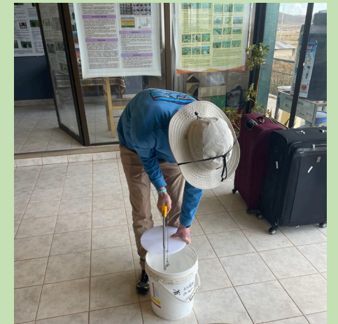
Jacob Child prepares materials for quinoa washer