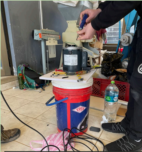
Trevor Wiseman assembles motor on washer