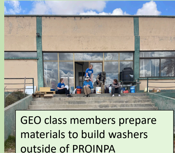
GEO class members prepare materials to build washers outside of PROINPA