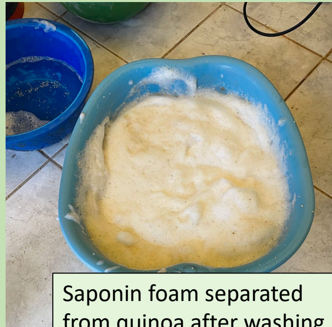
Saponin foam separated from quinoa after washing