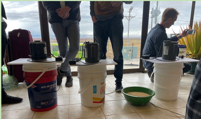
The three quinoa washers constructed during our visit to PROINPA